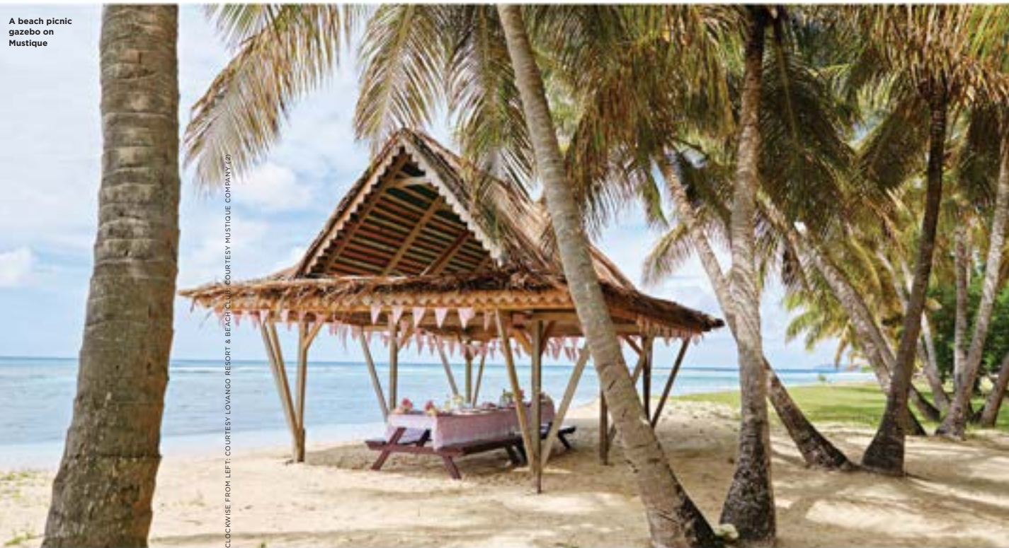
A beach picnic gazebo on Mustique