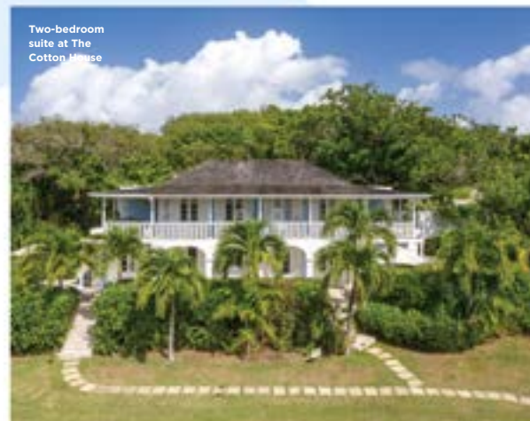
Two-bedroom suite at The Cotton House

Eaux for early Mustique adopter Princess Margaret) tucked among the jungle and palms, the allure and design sensibility of Mustique was hatched—and remains a Caribbean institution more than a half-century later. Here is where the most celebrated celebrities, from royals to rock stars, still decamp to relax, to hit the weekly cocktail mixer at The Cotton House and jump-up dance at Basil's Bar, to picnic under thatch along the island's superlative beaches, and to enjoy the barefoot insouciance of it all. And it's possible, by renting one of 82 villas available or tucking in at The Cotton House, to draw that Mustique Style around one like the couture it is; mustique-island.com .