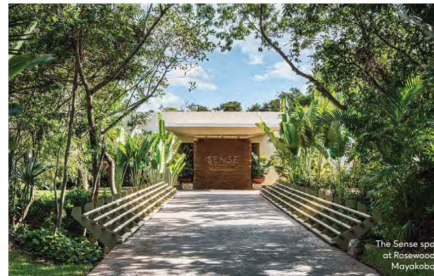
The Sense spa at Rosewood Mayakoba