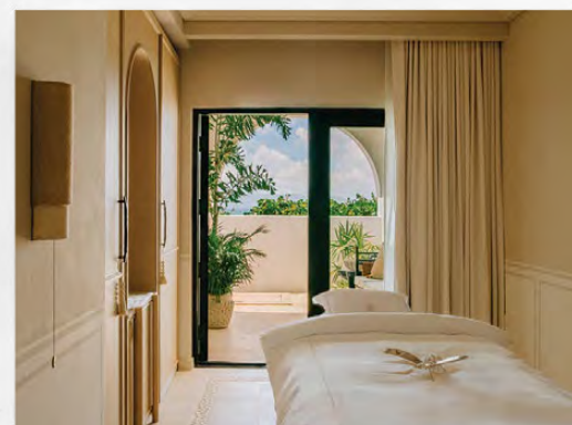
FROM TOP: A treatment room at the Cap Juluca Spa by Guerlain; the entrance courtyard

Cap Juluca, A Belmond Hotel , is unveiling an array of family-friendly adventures and wellbeing experiences in partnership with Guerlain. The Cap Juluca Spa by Guerlain , overseen by design studio Rottet Studio, invites guests to indulge in a curated selection of exclusive Guerlain rituals designed to harmonize body and mind. Unique offerings include the Ocean Vibes experience, which uses an ocean tambour and ice bubbles to evoke the calming ebb and flow of the sea. belmond.com