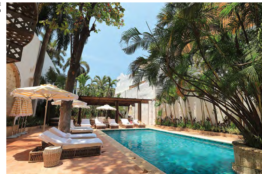
The pool at Casa Pestagua

Casa Pestagua , a historic 17th-century colonial mansion-turned-luxury boutique hotel, recently reopened its doors after a $15 million renovation. The sister property to Casa San Agustin, an elegant boutique hotel encompassing three restored 17th-century colonial homes located just minutes away in the old city, offers guests the opportunity to couple their stay and access each hotel's unique amenities. New updates include a refurbished lobby, restaurant, bar, fully equipped gym and five new suites. The 16-room colonial structure features a lush courtyard with a swimming pool and Ánima restaurant serving traditional Colombian cuisine. Guests can also enjoy the ACASI experience with an excursion to Isla Barú, a remote tropical island off Colombia's Caribbean coast where Casa Pestagua and Casa San Agustin guests have exclusive access to a private white sand beach. casapestagua.com