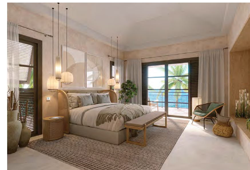
A villa bedroom at Half Moon